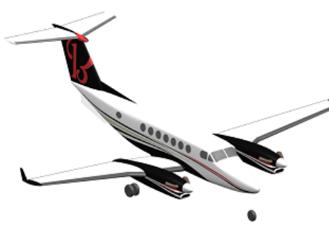
Beechcraft King Air 350