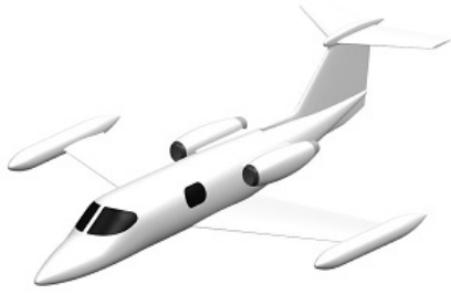
Learjet Model 23